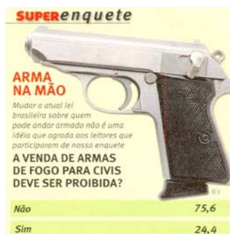
Figure 2. Voting through web site www.superinteressante.com.br (Super Interessante Magazine, ed. 202 (07/2004)]

The first meeting started with a parallel comparison between the determinism of mathematics and the uncertainty of statistics. Some basic concepts of sampling were given, highlighting the importance of a representative sample in order to obtain a precise estimate. In the didactic practices, nine activities showing research published in magazines or newspapers that presented problems of sampling and doubtful inferences or without a scientific base, were given to the participants, who were challenged to identify errors and important omissions, as for example, the research represented in Figure 2.