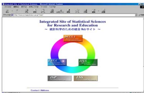
Figure 3. Top Page of Integration

As the inter-university network system is improved, accumulating and sharing digitized educational materials on the Internet will be further required in various areas of education. It is hoped that study of our project working would be of some help.