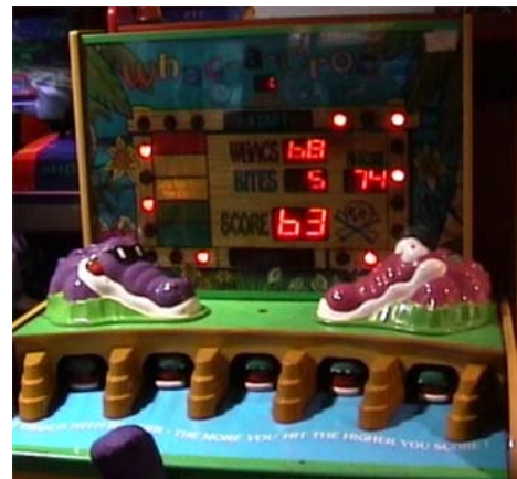
Figure 1: The whac-a-croc machine.