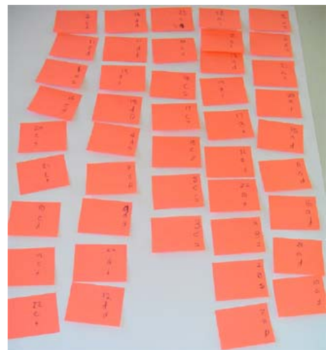
Figure 4: A frequency graph of Croc-ID made by S11. This was the only single-attribute plot made by a student in the Data Card group.

Another possibility is that with sticky notes, students can opt to use physical space rather than formal axes to organize the data. They can organize the sticky notes in small steps using simple actions such as separating them into groups and ordering them according to the value of one of the attributes. These actions require less forethought than having to create formal axes and they produce results that can be easily modified or extended; sticky notes that have been stacked up can then easily be reordered according to the values of an attribute. Also, should a student